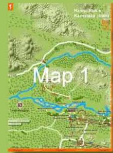
Hampi Bazaar , Hemakuta Hill area , Virupaksha Temple & Virupapur Gadde