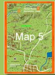
Archeological Museum, Domed Gateway, Pattabhi Rama Temple, Bhima's Gate, Ganagitti Temple, Malyavanta Hill, Dannayaka Enclosure, Granaries, Royal Enclosure, Hazara Rama Temple, Horse Stable, Pattanada Yellamma Temple, Zenana Enclosure, Lotus Mahal, Elephant Stables, Fortified Walls, Tenali Rama Pavilion, Jaina Temple, Ranga Temple, Srinagarada Hebbagilu, Queen's Bath, Bhojanasala, Octagonal Water Pavilion, Basement of Palaces, Octagonal Bath, Chandrashekara Temple, Saraswathi Temple, Rockcut Shrine