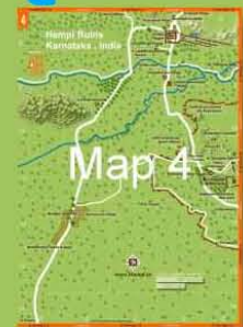
Akka Tangi Gundu, Chandikesvara Temple, Kadirampura Village, Krishna Temple, Mohammadan Tombs & Darga, Mohammadan Watch Tower, Murugan Temple, Noblemen's Quarters, Uddana Veerabhadra Temple, Underground Siva Temple